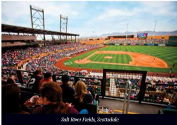
Salt River Fields, Scottsdale

Tempe Diablo Stadium is the oldest of the Cactus League's spring training facilities. Tempe is also home to the main campus of Arizona State University , which features the Mona Plummer Aquatic Center and Sun Devil Fitness Center , offering 135,000 sq. ft. of indoor space that can host sports such as badminton, gymnastics, soccer, volleyball, racquetball, weightlifting and basketball, in addition to outdoor soccer fields and tennis courts. ASU's Sun Devil Stadium is undergoing a $300 million renovation designed to transform the venue into a year-round events center and entertainment district.