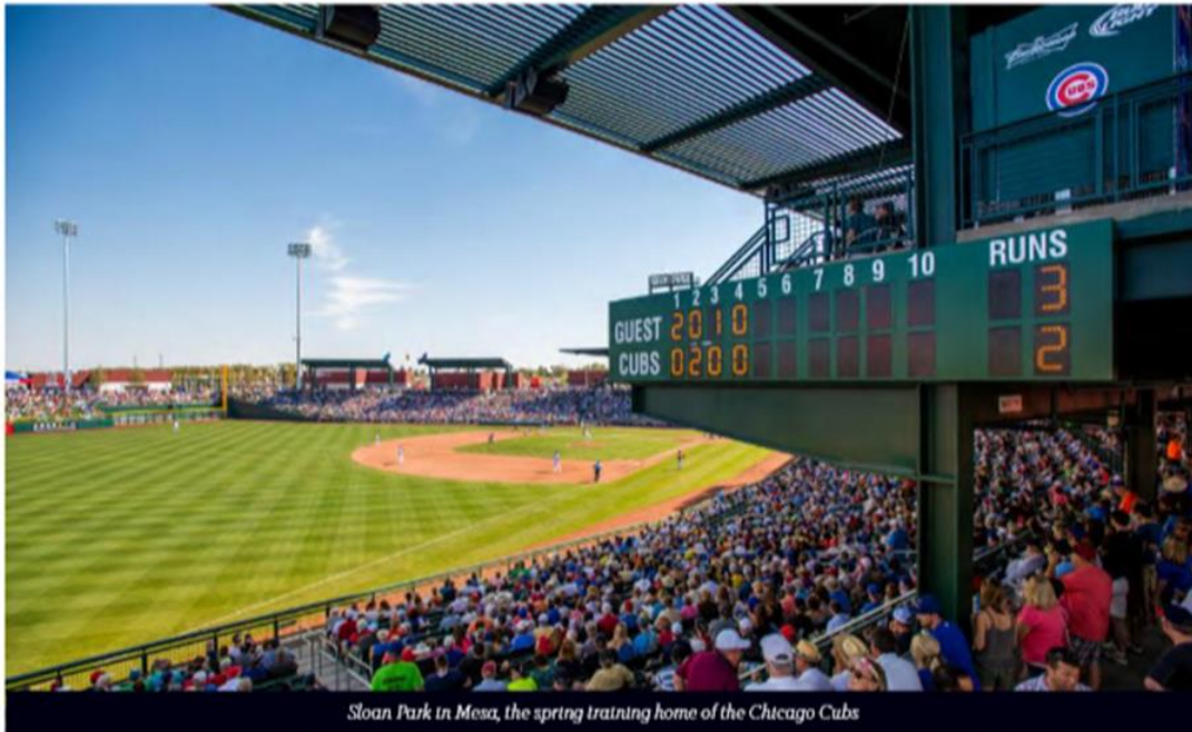
Sloan Park in Mesa, the spring training home of the Chicago Cubs

The Super Bowl, the College Football Championships and the Final Four — not to mention the home games for the NFL's Arizona Cardinals — are all played at State Farm Stadium (formerly the University of Phoenix Stadium) in Glendale. Located across from the stadium in the Westgate shopping